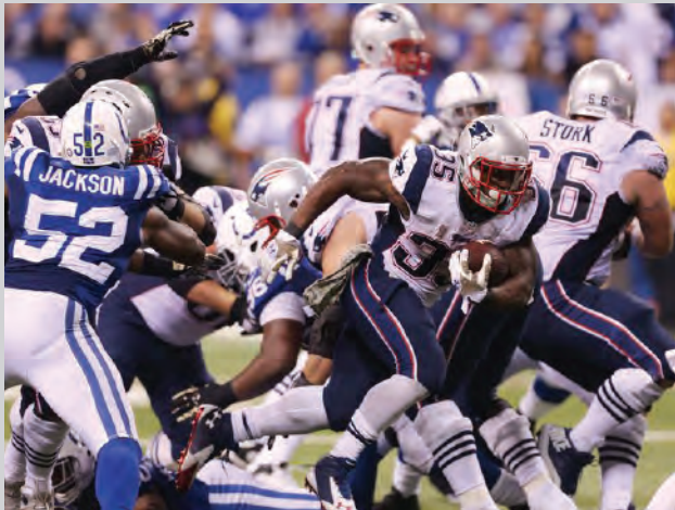
The Patriots blew past the Colts to go to the Super Bowl.