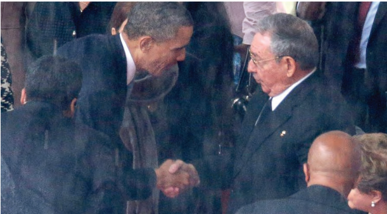
Obama and Raul Castro shake hands at the funeral of former South African President Nelson Mandela.