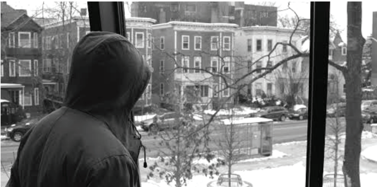
CRLS students look forward to the busy semester ahead, filled with academic challenges and social festivities.