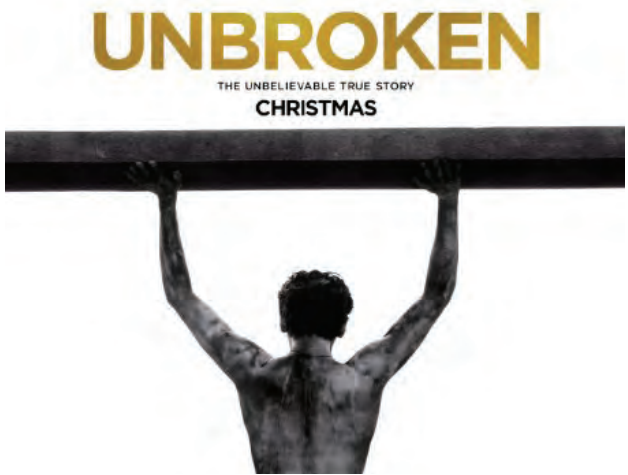
Unbroken has grossed $110 million domestically thus far.

feats of resilience, because of minimal dialogue, the state of O’Connell’s character can only be judged by his appearance, which does not reveal Zamperini’s persistent optimism. The scattering of flashbacks throughout the beginning of Unbroken could have addressed the source of Zamperini’s strong will, but fall short in providing a