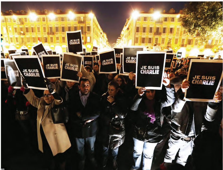
Protestors crowded the streets of Paris after the Charlie Hebdo terrorist attacks.

on all different groups of audiences, ultimately making dark humor the “standard”. France is no stranger to satire as well, but this standard was challenged on January 7 when a terrorist attack was made on the satirical magazine Charlie Hebdo