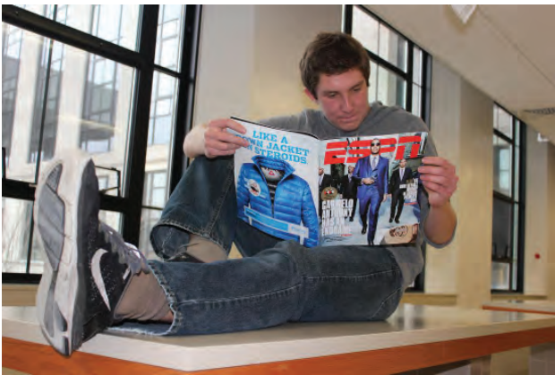
CRLS students are constantly bombarded by media-defined standards of beauty.

The models BMI stands in sharp contrast to the average or healthy BMI of a woman, described as 18.5- 24.9 by the U.S. Department of Health and Human Services. The difference is extreme. How would you feel, if you were 5.0’,