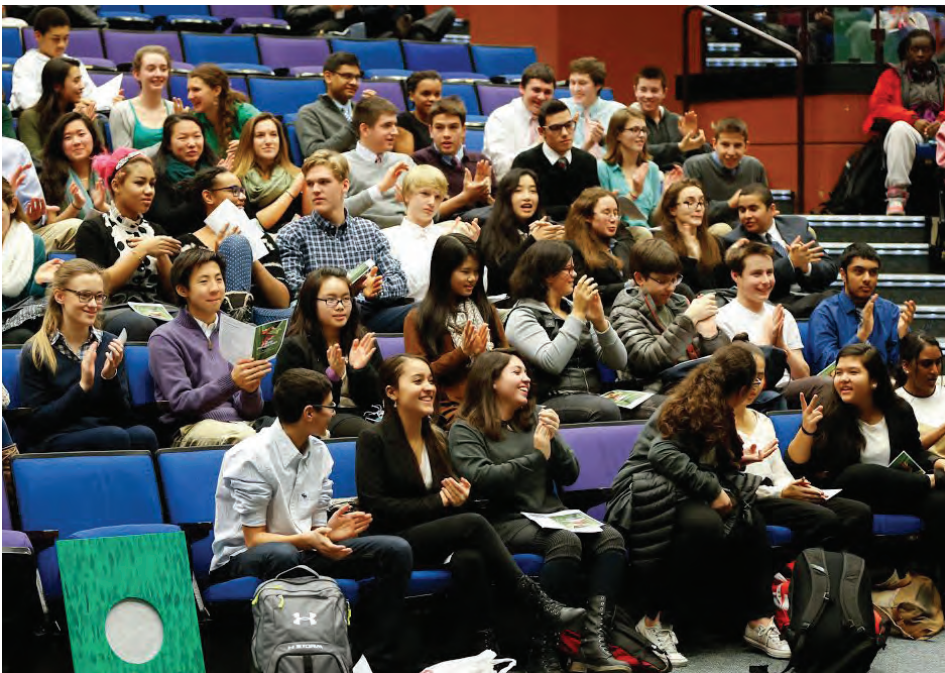
Eleven teams competed in the Glocal competition this year, which culminated in an exciting final presentation in the auditorium.