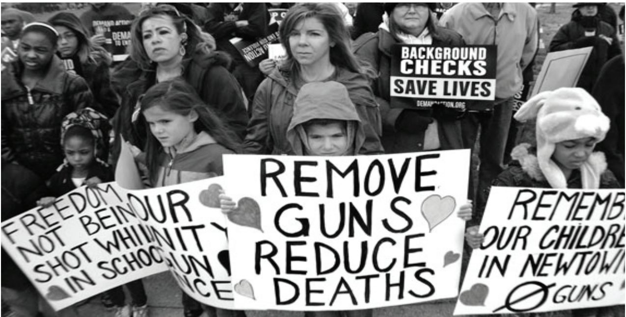
Indianapolis residents call for gun control laws in a protest.

Another developed country that has a much lower gun homicide rate is Spain. All owners must be licensed and undergo strict psychological and medical testing, and their guns must be inspected annually. Other developed countries with similar gun laws are Germany, Australia, Netherlands, Switzerland, and Canada which are just a few of many others.