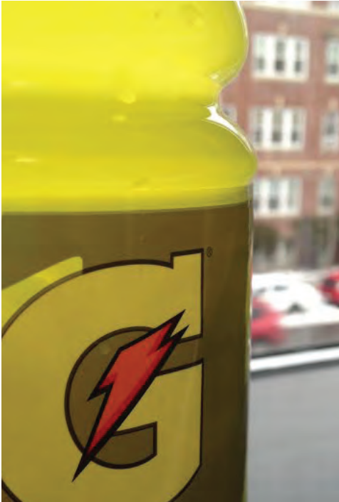
Gatorade has struck a deal with CRLS.