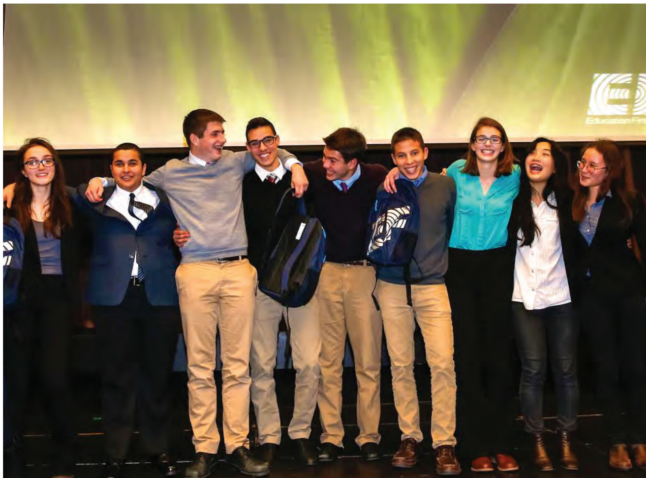
The Glocal winners receive a free trip to Costa Rica thanks to the generosity of Education First and the City of Cambridge.

In Costa Rica, the two winning teams will be able to gain inspiration from the country, known for its environmentally conscious design, engage with fellow high schoolers from around the world about important issues at the summit itself, see (and perhaps meet!) noted wildlife ex-