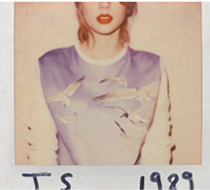
J Cole’s and Taylor Swift’s album’s were some of the most popular albums among Rindge students in 2014.