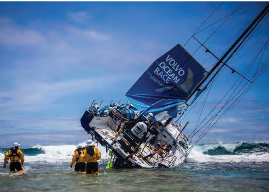
Team Vestas Wind assesses the condition of their VO65 after running aground on a remote reef in the Indian Ocean during leg 2.

In this year’s race edition there are seven teams racing 38,739 nautical miles including, Team SCA, Abu Dhabi Ocean Racing,