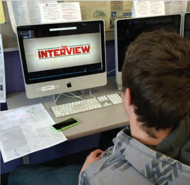
Even Register Forum editors enjoy The Interview.

After much hype about the withdrawal of the film, its opening weekend grossed a total of