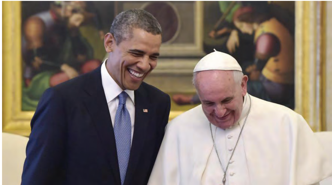
President Obama and Pope Francis first met in early 2014.

Ultimately, while Francis isn’t perfect, his progressive nature is a turn in the right-direction for the much-maligned Catholic church. He has begun to undo much of the damage done by the sex-abuse scandals that brought the Church to its knees in the past decade. He has finally returned the Church to its rightful place as a religion that preaches love and compassion, not intolerance and hatred.