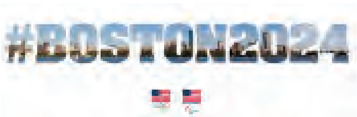
The Olympic Committee will determine the 2024 Olympic host in early 2017.