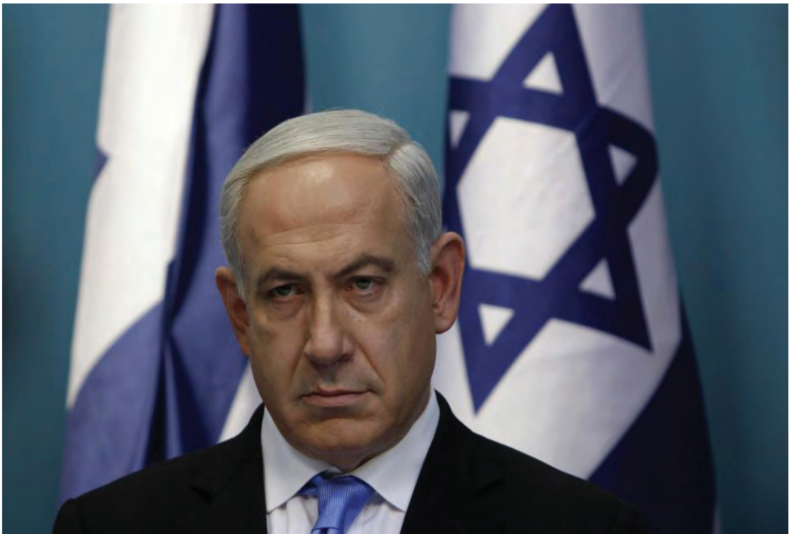
Prime Minister of Israel Benjamin Netanyahu broods.

Prime Minister Netanyahu is no stranger to American politics. He made his voice heard loud and clear in Washington in 2012 when he denounced President Obama by very publicly endorsing Mitt Romney for the presidency. In D.C. he has even acquired the nickname, “The Republican Senator from Israel”. This scuffle becomes part of the larger picture of the problems with Israel and its overbearing relationship with the world that seems to stem from an overinflated