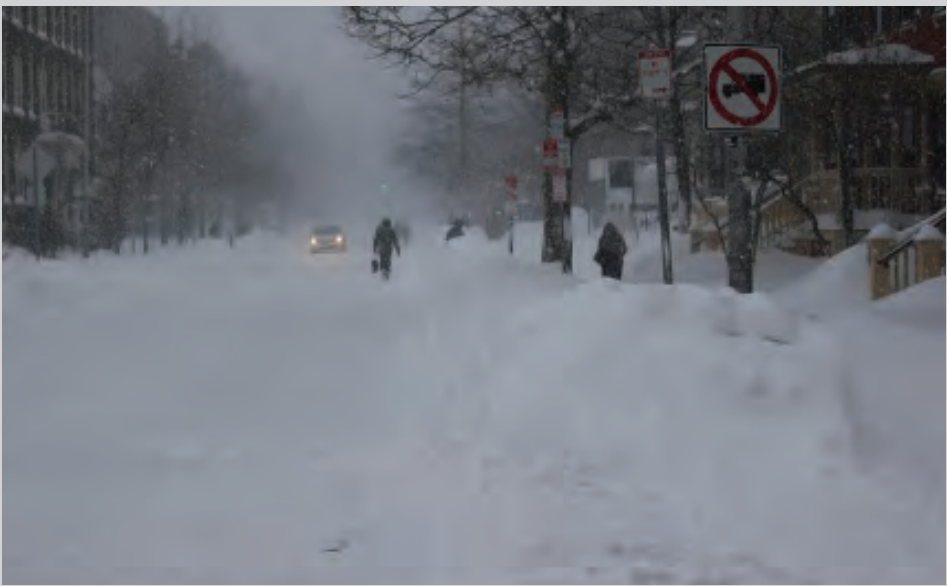
Cambridge streets were rendered nearly impassable by recent storms.

Although we are enjoying our time off now, the days are going to add up to the end of the school year. CRLS' original last day was