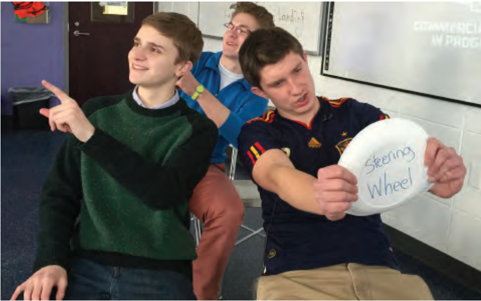
CRLS Register Forum Senior Staff drive safely through room 2309.

As drivers schools go, the CRLS Program is one of the best. Approximately 100 students take the course every year, with about