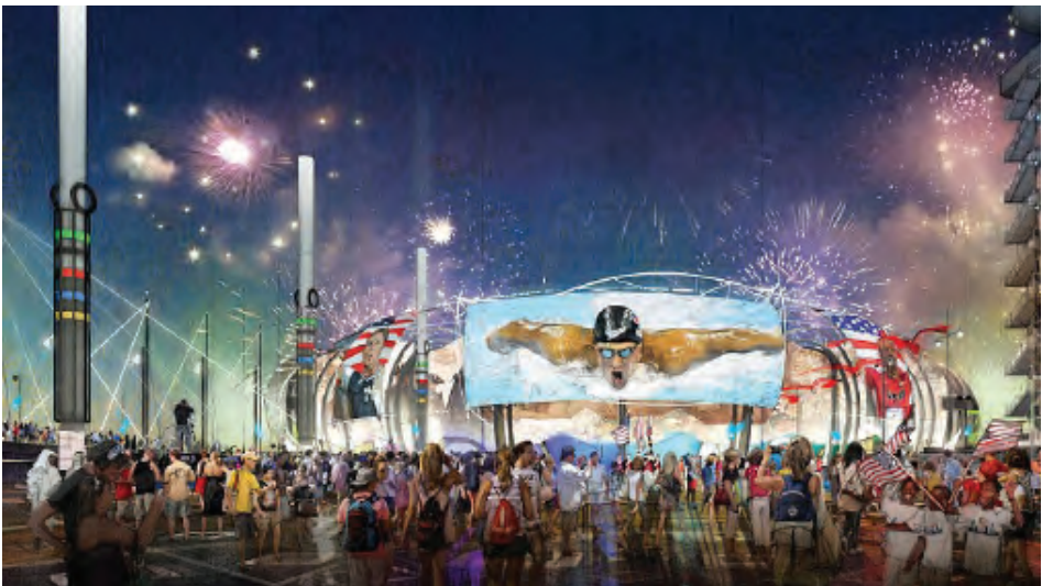
A temporary Olympic Stadium would be built in Boston’s Widett Circle for the Games.

just associate with dollar signs. Residents of Boston could walk a few blocks and see a marathon or hop on the train and watch a swim meet, and it’s as easy as that. On the flip side, there are some concerns