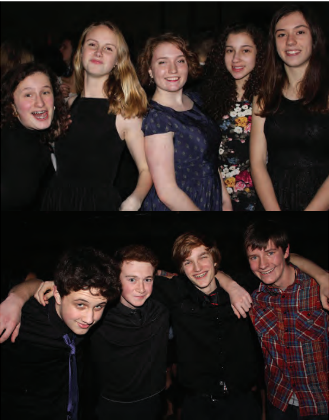
CRLS students thoroughly enjoyed themselves at the annual Winter Formal.

When asked what he would eliminate from the event to lower