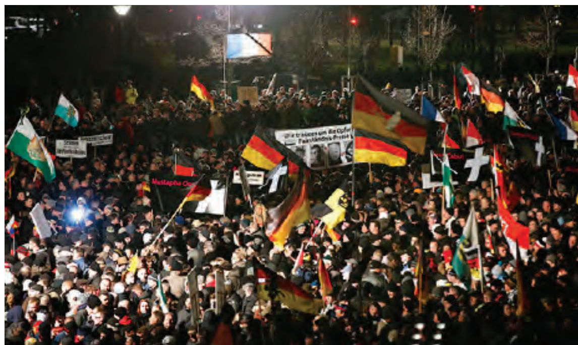
PEGIDA protestors are anti-Semitic, anti-Islam and part of a new, extremist political wave in Europe.

of a single person who sympathizes with them, and at my school some even harbor resentment towards these racist groups and indi-