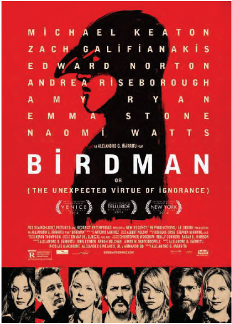
Birdman won Best Picture at the Oscars.

Another thing that takes away from the film is its ending, or rather a part added by the filmmakers after the movie could have come to a natural stop to create positive feelings of hope, whimsy, or magic, which were not central themes of the film. Birdman is a movie about the depressing crushing constant human search for validation and the fear of disappearing, what it truly