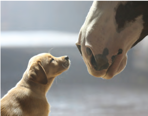
Budweiser's ad included its signature Clydesdales.

Another surprising commercial was the “Always” commercial. Now its no secret that the commercials on the sports networks do not often