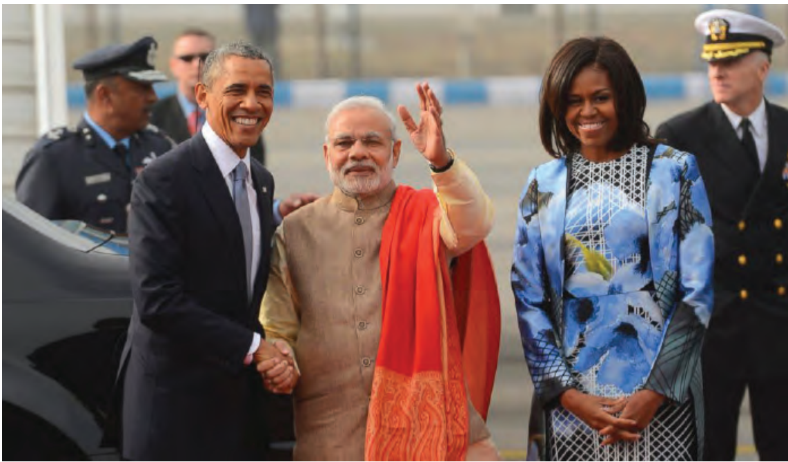
President Obama met with Prime Minister Modi last month.