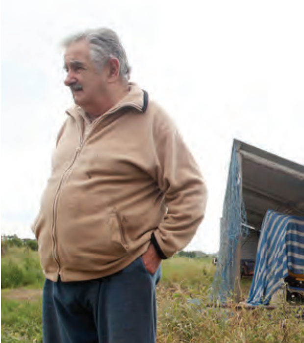
Mujica at his humble farm.

“We can learn...from Mujica, who is the epitome of selflessness.”