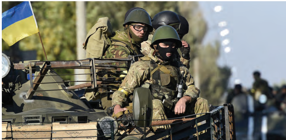
Ukraine has been on the offensive ever since recapturing several key cities last fall.