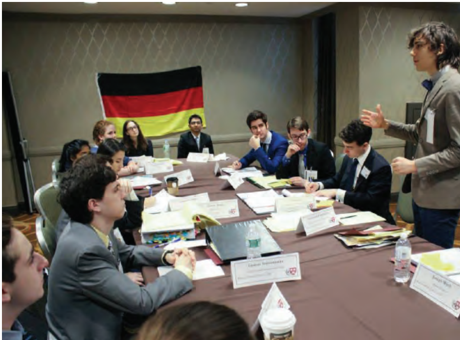
Students from around the country and around the world collaborate at the Harvard Model United Nations.