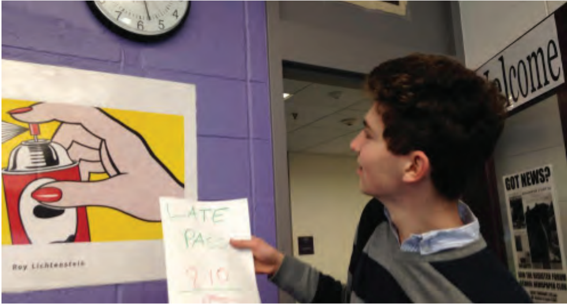
Even Register Forum editors sometimes succumb to tardiness.

Student response to the policy has been mixed, with many students confused or underinformed about the