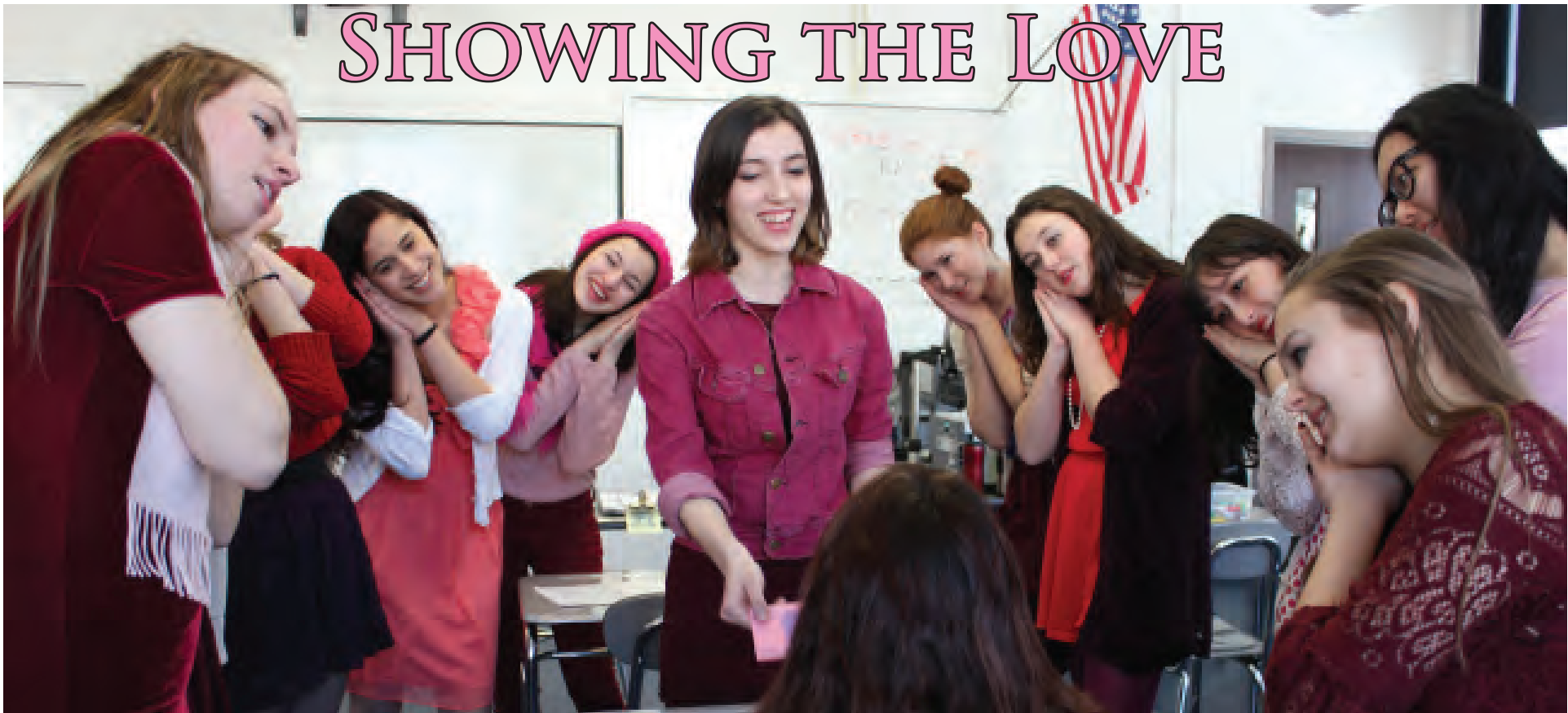
CRLS a cappella group Girls Next Door sing to a lucky student on Friday, February 13, 2015.