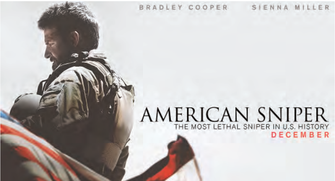
American Sniper has grossed more than $428.1 million since its release in January.

Iraqis -- there is little gray area on either side. For example, one of the film’s major villains, The Butcher, is sadistic and amoral: at one point midway through, he kills someone in a manner that is needlessly