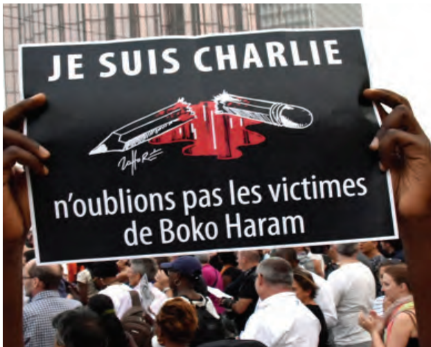
A man holds a poster reading, “I am Charlie, let’s not forget the victims of Boko Haram”. 1.6 million people and over 40 world leaders attended the rally in Paris.

This comparison makes it starkly clear that much of the press is not objective-- that it is biased and unreliable as a source of information for those who want to know what is going on in all parts of the world. And yet, we rely on it nearly completely for all information on current events. As Eric White, a CRLS sophomore, put