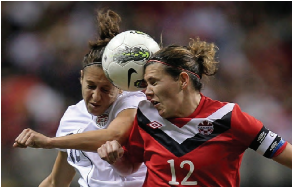
Headers in soccer have become a subject of controversy.

The same study found that, “college football players suffer concussions at a rate of 6.3 concussions per 10,000 ‘athletic exposures.’” It is alarming to students, parents and administrators just how vulnerable athletes are. As a result, there have