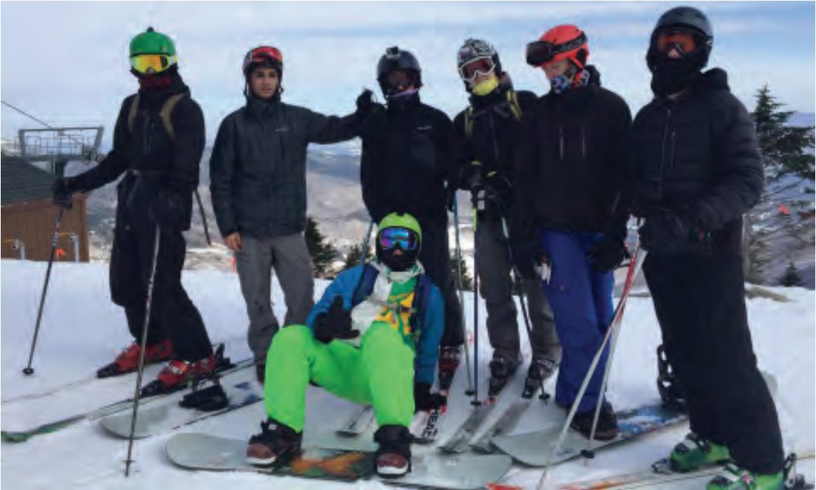
Ski Club members enjoyed skiing at Stowe Mountain in Stowe, VT this past February break.

The next step is getting ready for your ski lesson. The group will head to the ski rental area where you learn how to get the gear fitted for your feet Getting