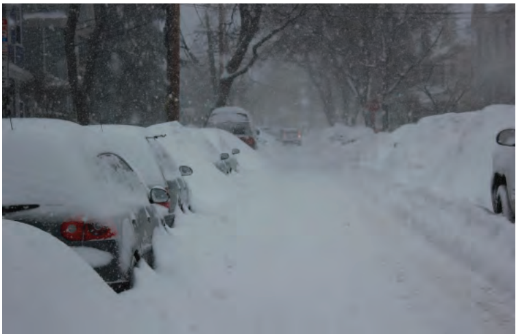
Three snowstorms resulted in six snow days.

Additionally, the MBTA's rail services (subway and commuter rail) were shut down on 7 pm on February 9th through all of Tuesday, February 10 "while maintenance crews